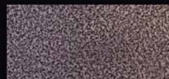
Powder Coat Grey Hammermill